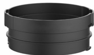
SmartBase R40 Support - 40mm Pedestal Extension Ring R100 Support - 100mm Pedestal Extension Ring