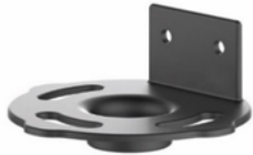
SmartBase -Timber Connector Plate