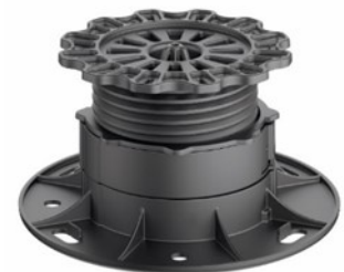
SmartBase 30-53mm Adjustable Decking / Paving Pedestal.