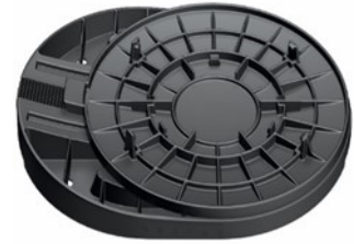
SmartBase Slope Correction Shoe 2.0mm up to 10 degrees