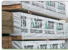
Un-treated Carcassing Timber