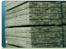
Tanalised® Carcassing Timber