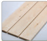
25mm Premium Plus Redwood