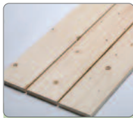
22mm Premium Grade Redwood