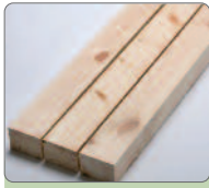
75mm Premium Grade