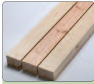
75mm Premium Plus Grade