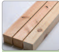
100mm Premium Grade