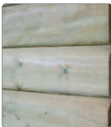
16mm Shiplap Cladding