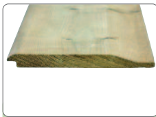
16mm Shiplap Cladding