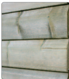
19mm Shiplap Cladding