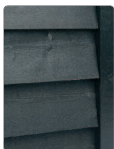
Essex Black Barn Weatherboard/Cladding