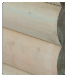
50mm Loglap Cladding