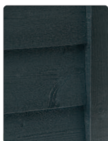
Pre-painted Black Cladding Rebated