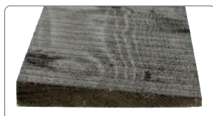
Essex Black Barn Weatherboard/Cladding