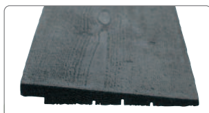
Pre-painted Black Cladding Rebated