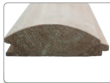
50mm Loglap Cladding