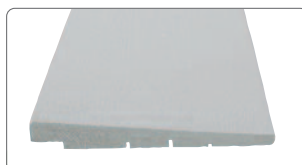
Pre-painted White Cladding Rebated