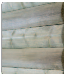
25mm Loglap Cladding