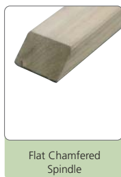
Flat Chamfered Spindle