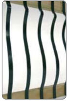
Baroque Baluster Black