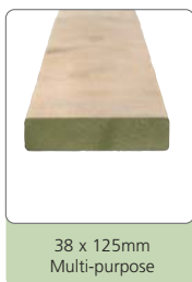
38 x 125mm Multi-purpose