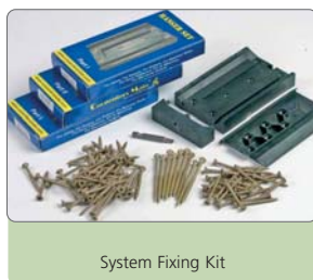
System Fixing Kit

The systems are supplied as a kit of parts including the 50 x 100mm and 38 x 125mm Multi-purpose material, the new 32 x 100mm Flat Chamfered Spindle and the new timber to timber connecting kit. The Grand Post material must be used to create the newel posts for the system. These can be ordered separately. Specific installation instructions are included in the kit of parts.