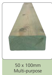
50 x 100mm Multi-purpose