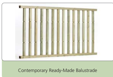
Contemporary Ready-Made Balustrade