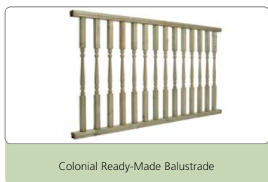
Colonial Ready-Made Balustrade