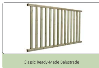
Classic Ready-Made Balustrade