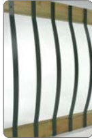
Arc Baluster Bronze